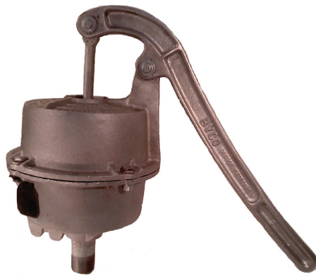
6" BYCO 502-60

BYCO primer pumps is now a division of Lane Manufacturing. These pumps have been field proven for many years in the Pacific northwest and are known as the smoothest operating pump on the market. We have expanded the line to add two 9 inch models for your larger pumps. All pumps are cast, machined and assembled in Oregon out of high quality materials.