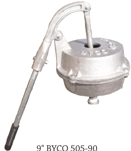
9" BYCO 505-90

MADE IN U.S.A. Field proven for over 30 years. Manufactured from time tested materials.